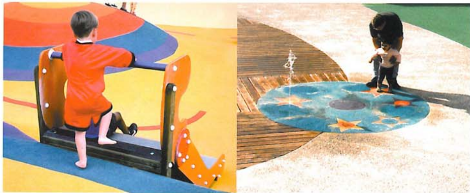
A thousand different details come together to ensure that every child will find something to suit his or her personality and preferences.