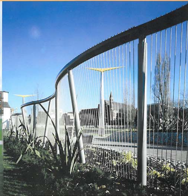
Different areas intended for all age groups have been included in the park, with plenty of space for bicycling and playing ball games.