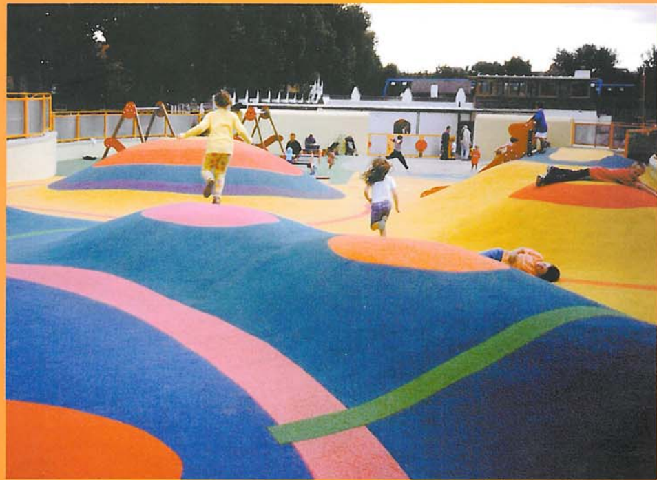
The risk of injury has been reduced to a minimum with these soft rolling hills, which comprise a veritable play paradise for small children.