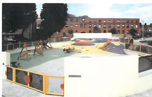
The smallest children can play in a reduced area, which has been appropriately walled in so that parents can easily keep an eye on their kids.